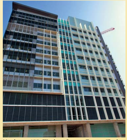
Verde at 455 Flinders Street, Townsville has been built to withstand cyclones.

headed up the development since inception.