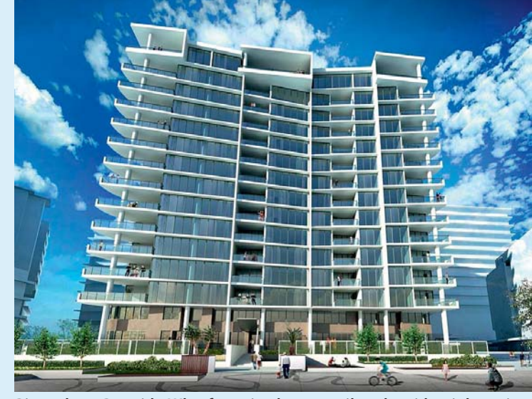
Pinnacle at Portside Wharf, a mixed-use retail and residential precinct along the Brisbane River in the blue-chip suburb of Hamilton.

Pinnacle at Portside Wharf earmarked to become a Brisbane icon, it had been important for Brookfield Residential Properties to find a respected and innovative construction company that would deliver a product of superior quality.