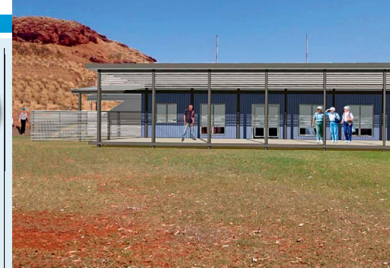
Artist's impression of the Newman Golf Club currently u