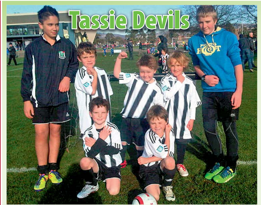
THE Westside Devils Legends Under 7s team proudly display their new Hutchies' sponsored shirts. Westside Devils is the junior club of Launceston City which play in the statewide league in Tasmania.

And they have sent a warning to the fish ... 'we're back next year so look out!'