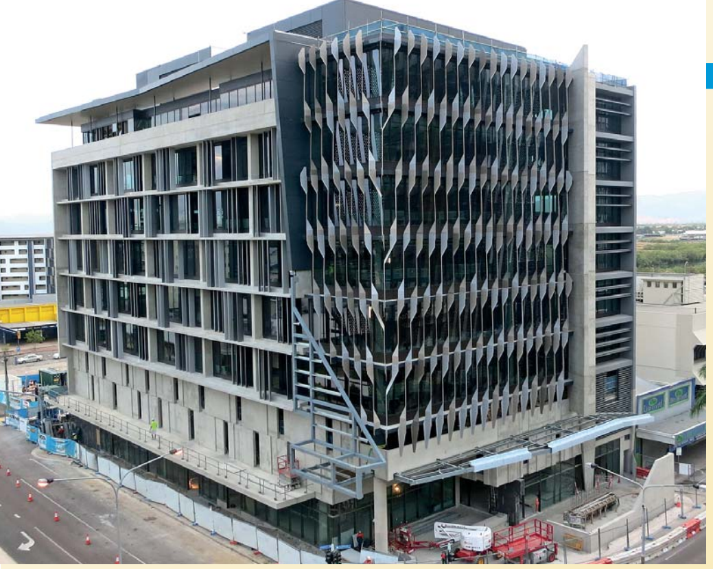
Removal of Hutchies' construction scaffolding has revealed a stunning new streetscape sculpture for Townsville at 420 Flinders Street.