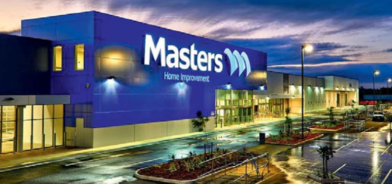
HUTCHIES has finished work on the first Masters Home Improvement centre in Mackay. Built at a cost of more than $14 million, the centre consists of 13,000m<sup>2</sup> of floor space with a dedicated garden centre and a 373-space carpark.

Scott said Pimpama Junction had zero competition on the eastern side of the M1 Motorway and a sizeable incentive budget to assist selected tenants.